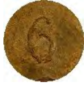
6 th S.C. Regt.